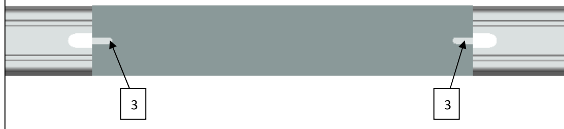
Fig 3: Fasten the Chain. Clip the spring part on the end of rail, fasten the screw nut clockwise till the illustrated length.

Fig 2: Fix up the short length rail then bend the clip3 outward with 180° angle.